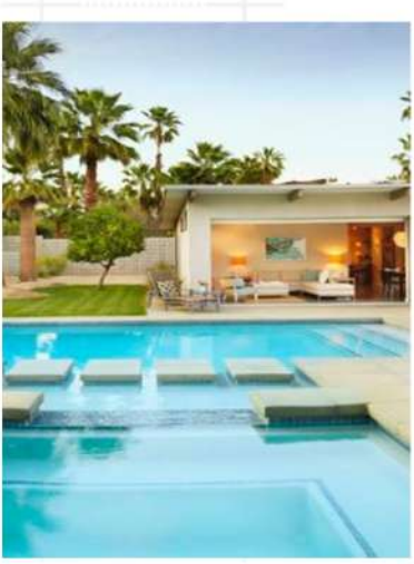
Solar LED Lighting